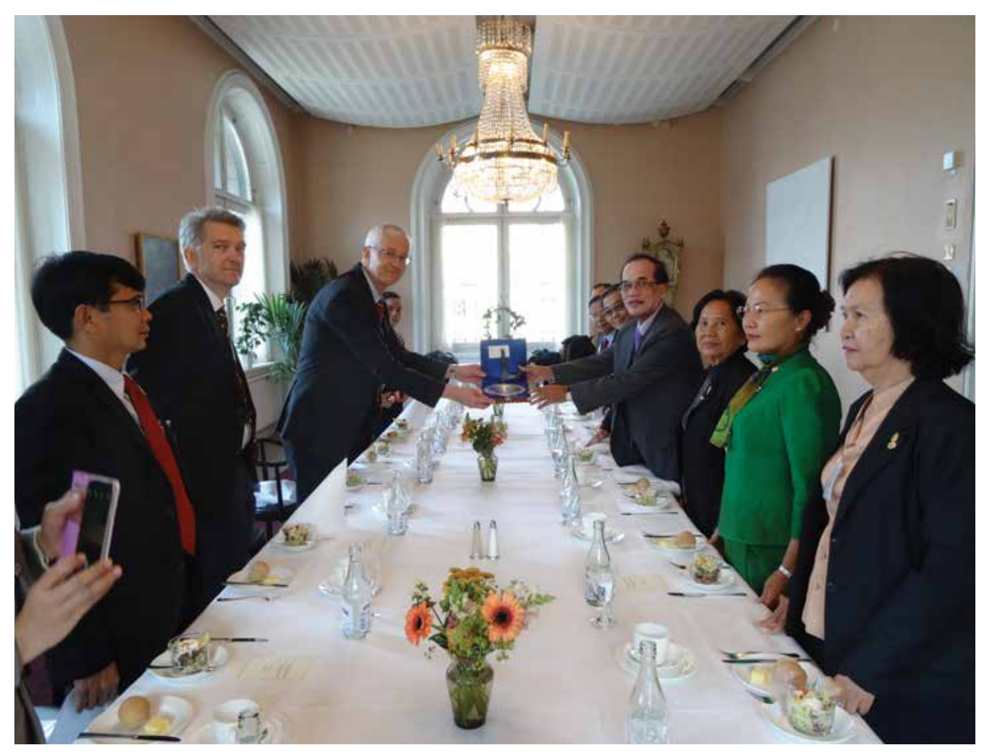
Working lunch: Discussion about Swedish Parliament experience of the establishment of the PBO